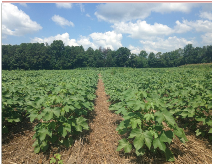
Fig. 1. A roll-killed cereal rye and crimson clover cover crop mulch suppressing weeds in a conventional cotton trial in Lewiston, NC.