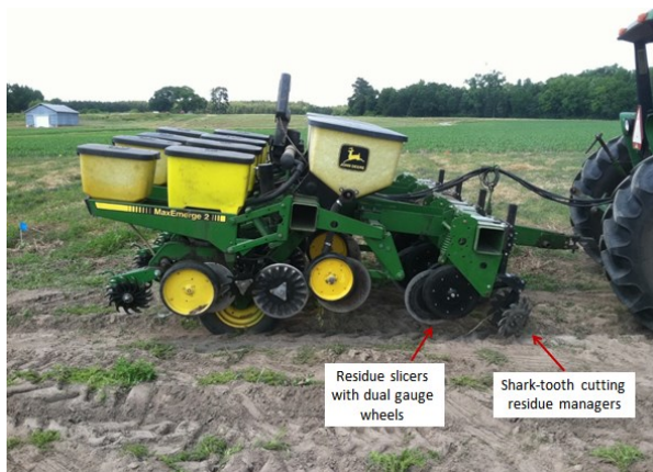
Fig. 2. Added front toolbar equipped with residue managers to aid planting into high cover crop biomass mulches.

Using cover crops for weed control can help reduce dependency on cultivation as the primary weed control mechanism in organic grain production. For organic producers, it is important to achieve greater than 8,000 lbs dry cover crop biomass/ac (8,891 kg/ha) to get consistent weed control from the cover crop mulch. Cereal rye can serve as an excellent cover crop for weed suppression prior to organic soybean production. Soybeans fix their own nitrogen and, therefore, limited nitrogen release from the cereal rye cover crop is not problematic. More information on weed control from a cereal rye cover crop in organic soybean production can be obtained from Chapter 9 in the North Carolina Organic Grain Production Guide. Using cover crops for weed control in organic corn production is more complicated. Consistent weed control and nitrogen availability are limiting factors to yield in organic corn production. While a cereal rye cover crop can provide excellent weed suppression in the subsequent cash crop, it has limited value for nitrogen release due to a high C:N. A legume cover crop can provide substantial nitrogen release to a corn crop, but a legume cover crop has limited value for season long weed control because the cover crop residue breaks down rapidly. Using a cover crop mixture of