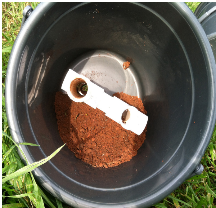
Figure 12. Both units were used to sample an equivalent number of soil cores. This design not only showed no torque force on the pipe, but also showed little sign of soil buildup inside the pipe.