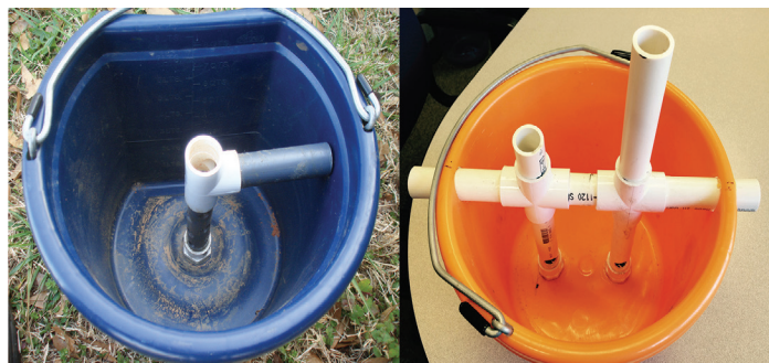
Figure 6. Client modifications to prevent PVC pipe from spinning when sampling moist soils. (Left) The side handle is held while sampling. This design has multiple soil exit holes. (Right) Another design with two sampling depths and pipe through the pail sides for stability. This design has single soil exit holes.

The 3/4" holes in this design provided an easy exit point for dry soils. However, several clients noted that if heavier soils with some moisture in them – not mud, but “plow moisture” soils – were sampled, repeated sampling could leave a thin layer of heavy soil into the PVC pipe and cause a rotation stress or torque on the pipe. This caused the PVC pipe to spin while sampling. The clients addressed the issue by gluing a cross-bar or tee-bar arrangement to the soil sampling device that could be held, which kept the PVC pipe from rotating (see Figure 6).