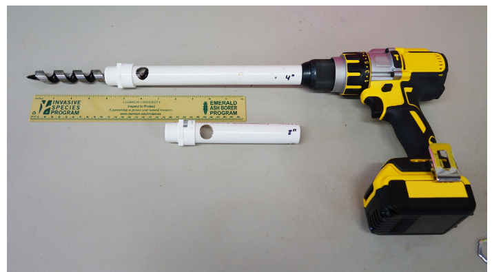
Figure 2. Completed PVC pipes used in the first design to limit sampling depth (one 4” depth; one 8” depth). Note the single hole which will allow soil to exit into the pail when installed.

The simplest way to determine the length of PVC piping required is to first slide a length of it firmly into a 3/4 inch Schedule 40 PVC male adapter (this may be simply friction-fit together instead of glued, since there will be no pressure and little force on the unit). Next, attach the Long Ship Auger to the drill to be used, and place the unit