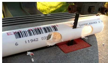
Figure 7. Two 3/4" holes were drilled in the pipe with a hole saw. A band saw was then used to remove material between the holes drilled to provide a larger soil exit point.

An alternative design to help alleviate this torque is to make the soil exit hole larger. The 3/4" hole saw was used to drill two holes completely through the PVC pipe approximately 3 inches apart on center, and then a band saw was used to remove the side of the PVC pipe between the holes (Figure 7). (A jig saw or coping saw could be used if the pipe is secured properly in a vise.) This creates a 3 inch long hole on each side of the PVC pipe, allowing a much larger area for soil to exit the pipe and leaving less pipe wall for the soil to compact against to cause torque. PVC crosses were used in the updated design like the ones in the client modifications in case there was any torque on the pipe with moist soils (Figure 8).