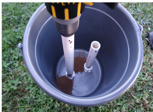
Figure 5. The completed original single hole unit in operation, showing dry soil exiting the pipe from the holes on both sides of the pvc pipe.

The 3/4" holes in this design provided an easy exit point for dry soils. However, several clients noted that if heavier soils with some moisture in them – not mud, but “plow moisture” soils – were sampled, repeated sampling could leave a thin layer of heavy soil into the PVC pipe and cause a rotation stress or torque on the pipe. This caused the PVC pipe to spin while sampling. The clients addressed the issue by gluing a cross-bar or tee-bar arrangement to the soil sampling device that could be held, which kept the PVC pipe from rotating (see Figure 6).