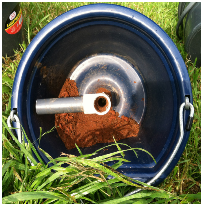
Figure 9. Image showing the soil buildup inside the pipe in the client’s tee-bar style unit, using a 5/8” Long Ship Auger drill bit and 3/4” Schedule 80 PVC pipe. Excessive wall-to-bit clearance was a factor.

The long exit hole unit, using 3/4” Schedule 40 PVC pipe and a 3/4” Ship Auger drill bit, worked satisfactorily during the test with very little torque induced (holding the edge of the bucket lightly was sufficient to prevent spin). Soil did not appear to build up inside the tube (Figure 12), partially due to the ease of soil exit with the larger hole and partially due to the closer clearance between the 3/4” drill bit and the PVC pipe wall. Soil may build up over time based on client observations, but in the approximately 20-core test there was little noticeable soil buildup.