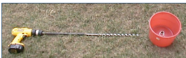
Figure 1. The original Oklahoma State Sweatless Soil Sampler.

There was, however, no way to accurately gauge how deeply the drill bit was going into the soil when obtaining a soil core. Many soil testing labs