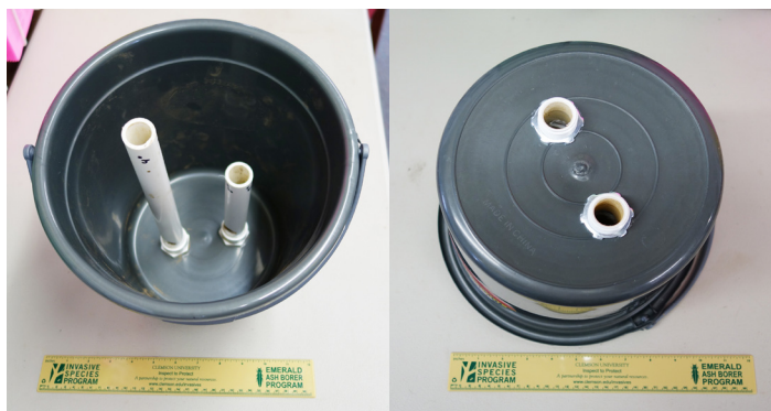
Figure 3. Completed Modified Sweatless Soil Sampler with single exit hole. This model has two sampling tubes installed, one for a 4 inch sampling depth, and another for an 8 inch sampling depth. Note the conduit nuts on the bottom of the pail holding the male adapters in place.

The soil exit holes can be made by carefully drilling a 3/4" hole through the PVC pipe just above the male adapter. Be sure to properly secure the pipe unit in a vise before drilling to prevent injury.