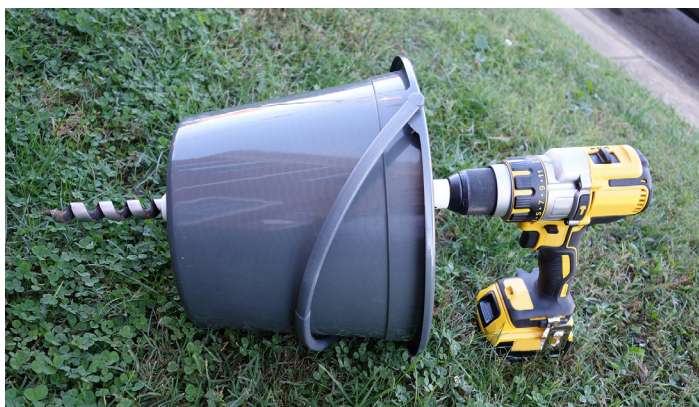
Figure 4. Completed unit showing the drill bit extending 4 inches past the male adapter after the drill chuck comes in contact with the pvc pipe.