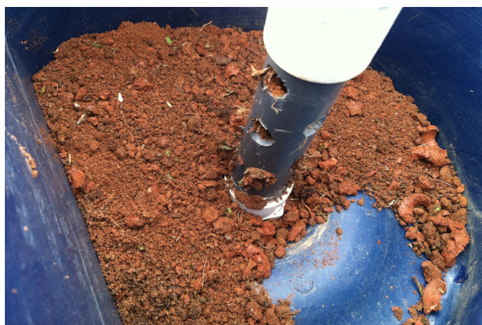
Figure 10. Even with multiple soil outlet holes, this design showed plugging issues in the 3/4” Schedule 80 PVC pipe, which possibly also contributed to the soil layer deposit in the pipe.

Based on the field test the long exit hole design is recommended. Clients with dry or lighter soils may find the single exit hole design satisfactory, but if not another hole can easily be added to the existing unit and the material removed between the two holes.