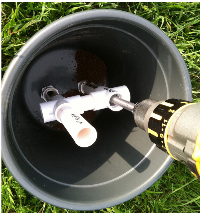
Figure 11. The long hole exit unit in use. This unit has two pipes to allow both 4 inch and 8 inch deep soil sampling. Note the soil exit holes are facing the pail sides, not the adjacent pipe, to prevent soil loss through the pipe not being used.

If all the soil sampling on your farm will be in pastures, hay fields, and no-till fields, a single pipe and male adapter assembly (with a cross pipe in case of twisting) placed in the pail to allow a 4 inch sampling depth will be sufficient. If, however, your farm also has tilled fields, adding another pipe / male adapter unit that allows the drill bit to penetrate to a 6 to 8 inch depth in the same pail is a simple process. Be sure to mark the depth of sampling on each pipe with a permanent marker in this case to prevent confusion.