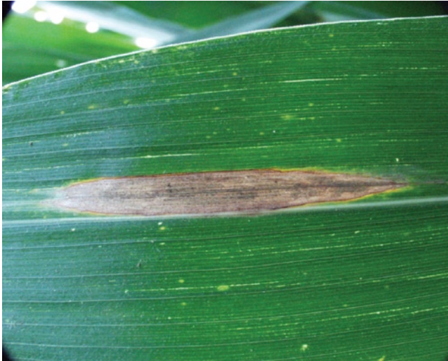
Figure 5. Northern leaf blight on corn

disease is favored by somewhat cooler weather compared to southern leaf blight and has been quite severe in the mountain counties. Under favorable conditions, the disease will spread up the plant. Heavily infected fields look dry and fired, as if they were injured by frost. The best control option for this disease is hybrids with genetic resistance.