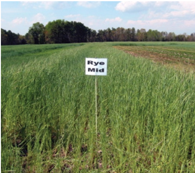
Figure 1. Rye cover crop at the appropriate stage for termination