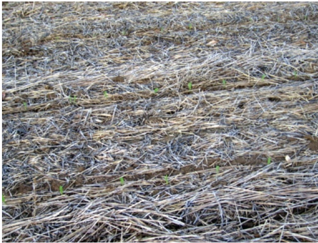
Figure 3. No-tillage corn planting into double-crop soybean residue

The residue present after a soybean crop that was no-tilled into small-grain stubble provides an excellent, water-conserving mulch for planting no-tillage corn.