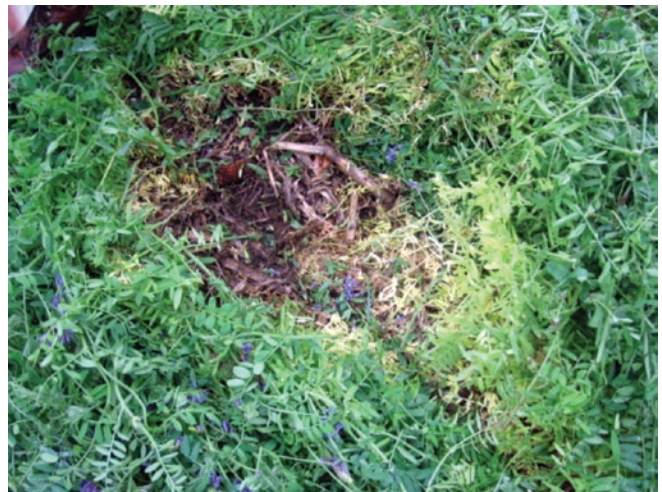
Figure 2. Hairy vetch cover crop

Hairy vetch, Austrian winter peas, and crimson clover are nitrogen-producing winter annuals. These legumes are capable of producing up to 125 pounds of nitrogen per acre if they are planted early in the fall and are killed as late as possible in the spring. Most of the nitrogen supplied by legumes is in the top growth. To obtain 100 pounds of nitrogen per acre, approximately 3,000 pounds of legume dry matter must be produced. In most years, this may not occur until after the normal corn planting date.