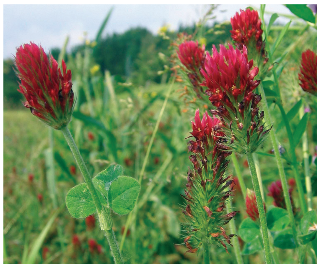
Crimson clover can be an effective cover crop.

Cover crops often affect pest pressures in the cropping system. Weed growth is suppressed on the soil surface by thick plant residue that blocks sunlight and physically slows weed seedling growth. Some cover crops produce allelopathic chemicals that inhibit the growth of weed seedlings. Others suppress parasitic nematodes by repelling, confusing, or starving them. However, some cover crops can support nematodes and diseases harmful to following crops, so care must be taken to select the right cover crop for the cropping system.