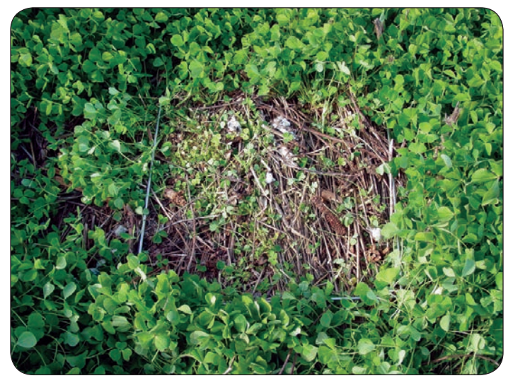
Accumulation of plant residue protects the soil surface. This picture includes the current crimson clover cover crop, cotton residue from last fall, cereal rye residue from last spring, and corn residue from over a year ago.

The Southeast has a long growing season with a wide range of climates. It is important to recognize how climate affects soil and residues. In warmer climates, soil activity is higher and crop residues break down faster than those in cooler climates. For example, in the Tennessee Valley region of Alabama (northern Alabama), some high-residue plots contain plant residues from two years prior. Rainfall variability may also affect the success of conservation systems. Proper management and timely planting of cover crops and cash crops, especially for dryland producers, is very important to the success of a conservation system.