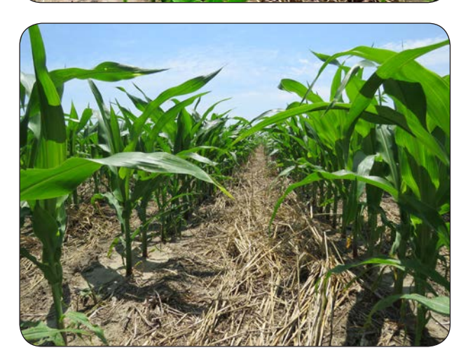
Corn growing in cover crop and previous crop residue.