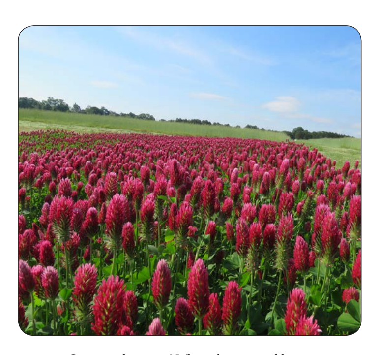
Crimson clover, an N-fixing legume, in bloom.

It is important to consider pesticide selection as a factor in your rotation. Check labels for rotation and plant-back restrictions. In addition, label information can be found on the Crop Data Management Systems website (<a href="http://www.cdms.net/Label-Database">http://www.cdms.net/Label-Database</a>) or on Greenbook (<a href="http://www.greenbook.net">http://www.greenbook.net</a>).