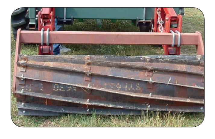
Curved crimping bar roller/crimper