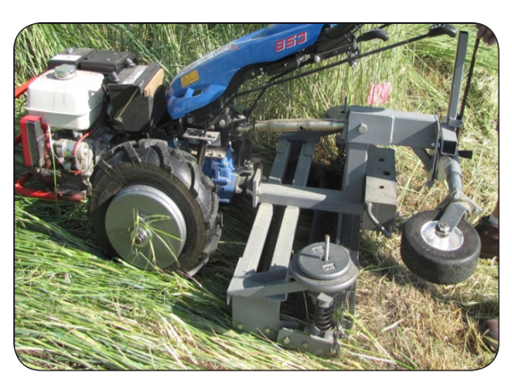
Two-stage roller/crimper for walk-behind tractors

(Kornecki, 2012, U.S. Patent #8,176,991 B1)