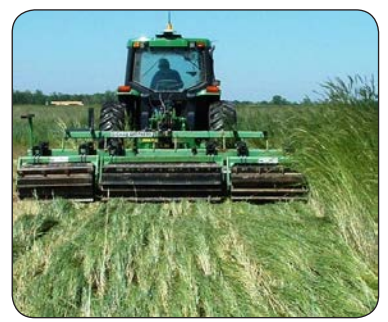
Rolling cereal rye.

Researchers are studying the effectiveness of using rollers as an alternative or in addition to herbicide application for termination. Tall cover crops (such as cereal rye) may lodge in multiple directions, reducing planting efficiency. Rolling cover crops parallel to direction of planting helps reduce "hairpinning", which is caused when residues that are not cut are pushed into the soil and become trapped in the seed furrow.