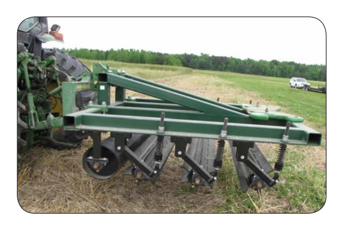
Four-stage roller/crimper (Kornecki, 2011, U.S. Patent #7,987,917 B1)