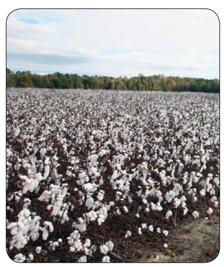
Adopting a conservation system can have a positive impact on profitability either from increasing yields and/or decreasing yield variability.

may decrease the amount of water needed during the growing season, thereby reducing water and energy costs. Depending on the type of cover crop grown and goals of the operation, there may be opportunities to grow a cover crop for seed production, utilize the cover crop as part of a grazing system, and other viable options to increase economic return.