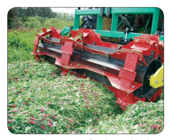
Rotary roller/crimper for elevated bed culture

(Kornecki, 2009, U.S. Patent #7,562,517 B1)