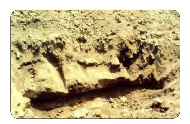
In-row subsoiling can loosen compacted layers with minimal surface soil disturbance.

Integrated management may prove to be the most effective tool against compaction. Using controlled trafficking patterns and cover crops can further diminish subsoiler requirements, reducing energy costs.