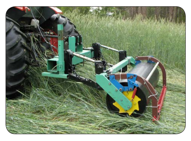
Smooth roller with oscillating crimping bar assembly

(Kornecki et al, 2009, U.S. Patent #7,604,067 B1)