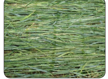
Cereal rye after crimping.

cut (mowed), the cover crops can re-sprout, while loose residue may interfere with planting operations. When rolling is completed at the appropriate plant growth stage, such as soft dough or later, the roller alone can be as effective at