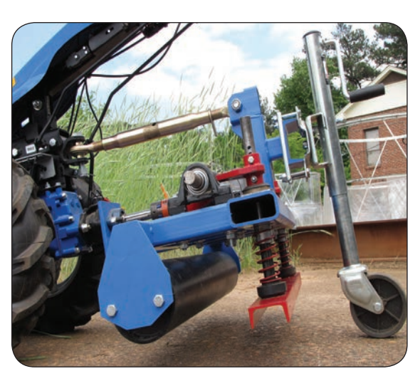
Powered roller/crimper for walk-behind tractors

(Kornecki, 2009, U.S. Patent #7,562,517 B1)