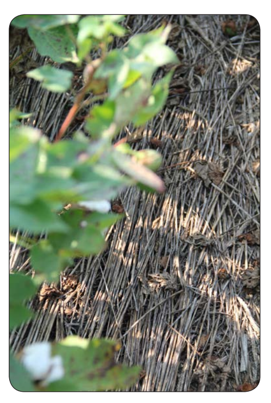
Thick cover prevents weed emergence and growth.

Weed management in conservation systems can be vastly different from conventional systems. Changes in weed composition will most likely occur. Conservation systems tend to promote perennial species and small-seeded annuals. Weed challenges will change over time; therefore, an effective weed control program must change as well. Traditional cultivation will no longer be an option in conservation systems; however, several alternatives are still available. These include practices which enhance the crop's competitiveness with emerging weeds.