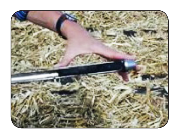
Adopting conservation systems helps build organic matter, increase biological activity, improve soil structure, and preserve soil moisture.

Soil structure or soil tilth will improve with a conservation system. Increased organic matter and biological activity improves soil aggregation, resulting in increased soil porosity and reduced bulk density. Residues on the soil surface also help reduce soil crusting by protecting the soil surface. Cover crop roots reduce compaction and loosen hard pans by creating root channels that subsequent cash crop roots can follow.