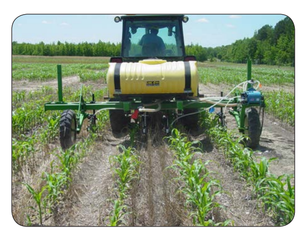
Corn sidedress N application at V6 in Central Alabama.

Over the years, a system that consistently includes winter legumes and has accumulated organic matter may meet much of the cash crop's demand for N. Research at the Old Rotation in Auburn, Alabama has studied this issue. A long-term winter legume rotation with cotton or corn resulted in yields equal to yields produced by 120 lb fertilizer N/acre. However, yields increased when legumes and fertilizer were used together. Cotton and corn response to legumes plus 120 lb N/acre was significantly greater than the legume- or fertilizer- only treatments. Therefore, a grower may be able to cut back on fertilizer N if necessary to save input costs, but to achieve top yields, covers should be used with additional fertilizer N.