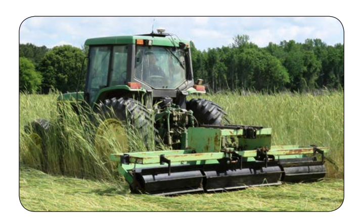
Straight crimping bar roller/crimper