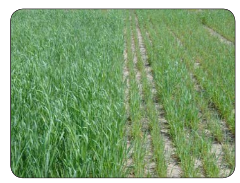
Fertilized rye (left) and non-fertilized rye (right).

Fertilizing cover crops is a recommended practice to maximize biomass production. Nitrogen is the only nutrient that must be added to cover crops unless there is a severe deficiency of P or potassium. Legumes will fix their own N if inoculated with the correct N-fixing bacteria. Other covers, however, will likely need N fertilizer. Cereals, such as rye, will do best if 30-40 lbs N/acre are applied on soils with low fertility. If residual N and organic matter levels are high, N fertilizer inputs may be reduced.