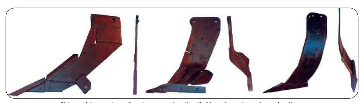
Side and front view of an in-row subsoiler (left) and two bent-leg subsoilers.

While conservation systems may reduce overall vehicle traffic in a field, wet soils that may be found under heavy residue are still susceptible to rutting and compaction. A controlled traffic system uses traffic lanes that become compacted enough to withstand heavy traffic without rutting, while leaving row middles free from wheel compaction. Precision guidance systems that are now widely available can be used to control trafficking patterns. Row information can be saved and used year after year to help locate traffic lanes.