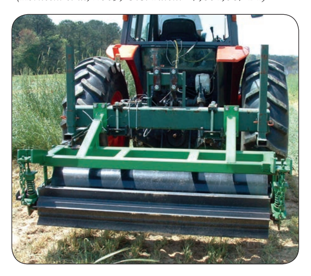
Two-stage roller/crimper (Kornecki, 2011, U.S. Patent #7,987,917 B1)

(Kornecki et al, 2009, U.S. Patent #7,604,067 B1)