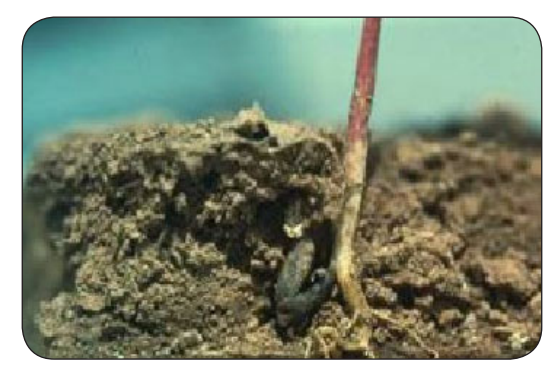
Shallow soil compaction resulting in soil resistance to a cotton seedling's root system.

Cover crops are an important tool for managing soil compaction. Many cover crops have aggressive rooting systems, which open channels for subsequent cash crop roots. Cereal rye, sorghum-sudangrass, and Brassica species (canola, turnip, and mustards) are known to be particularly effective at breaking through hard pans. Sunn hemp and lupins also have aggressive taproots that can penetrate hard pans. The presence of cover crops also enhances earthworm activity. Earthworm channels provide a path for roots to follow.