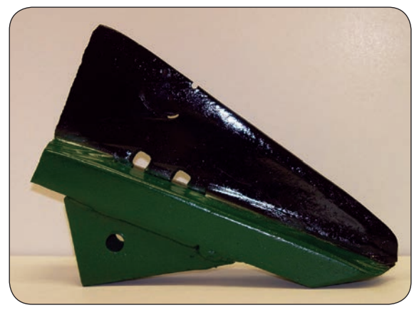
Splitter points help prevent soil blow-out, especially in dry soils. Newer shanks may incorporate this design, or a piece of metal can be welded perpendicular to the center of a subsoil shank tip.